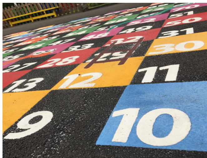
New playground marking!