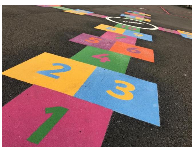
New playground marking!

Above are a few photographs to show off some of the improvements we have made during the summer break. We will share more photos on the school website and our twitter account which is @Ggibbonsps, please follow us.