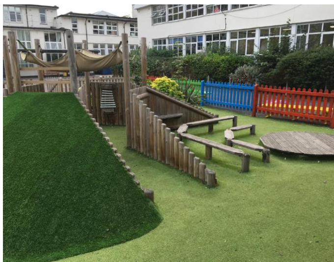
Refurbished play area!