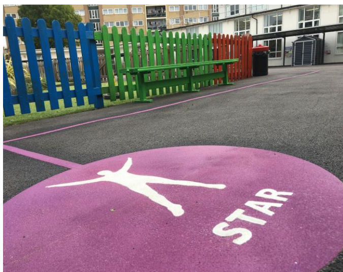
New playground marking!